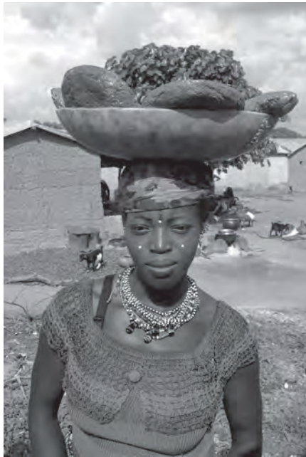
Figure 3.1 Fulani woman with traditional cheese in Northern Benin. By Frédéric Lhoste

societies (MacRae et al., 2005), but also play an increasingly role in developing countries.